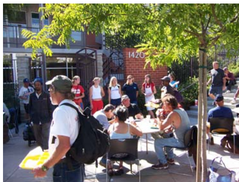
Our Savior's Lutheran Church choir performs on the patio